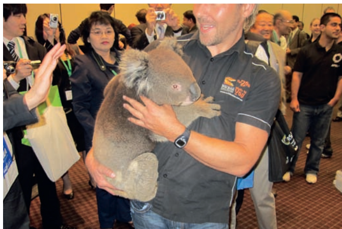
Australian Cultural Experience / Animal Showcase