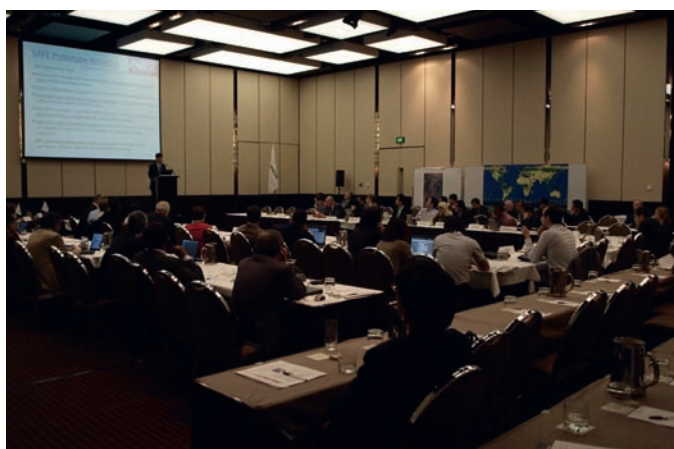
Earth Observation Working Group

It is important to encourage participation from the private sector. There are very important implications for collaboration between APRSAF governmental agencies and the private sector, and hopefully future EO Working Groups can further explore this cooperation to ensure that new space applications and technologies are fully supported in the mitigation and adaption required for climate change.