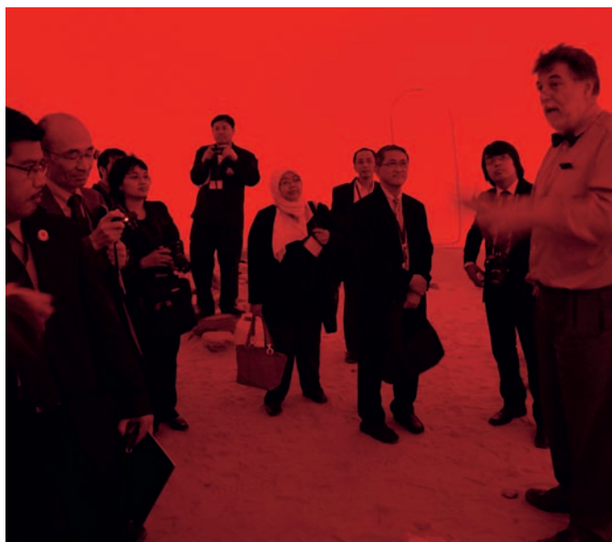
Simulation Environment on the Mars Surface