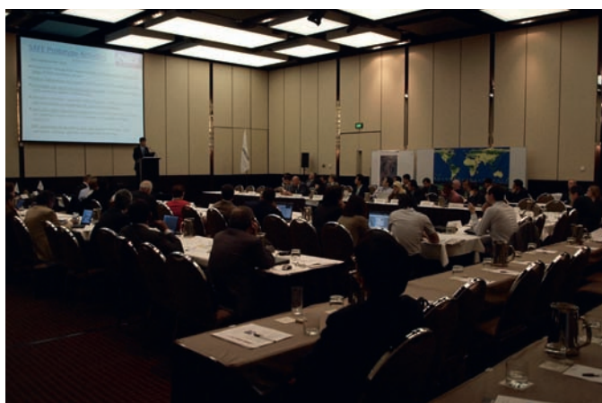
Earth Observation Working Group

It is important to encourage participation from the private sector. There are very important implications for collaboration between APRSAF governmental agencies and the private sector, and hopefully future EO Working Groups can further explore this cooperation to ensure that new space applications and technologies are fully supported in the mitigation and adaption required for climate change.